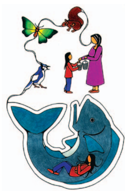
CLASSROOM ACTIVITIES AGES 4 TO 7