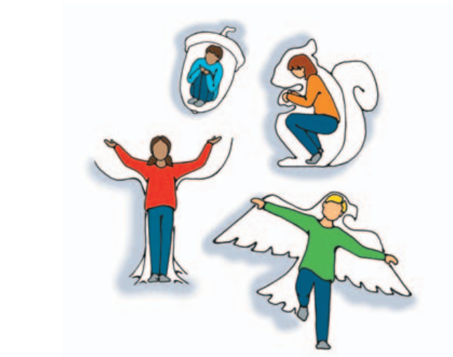
CLASSROOM ACTIVITIES AGES 8 TO 11