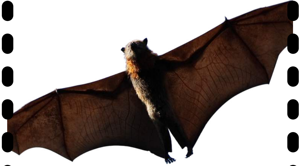
Big Brown Bat