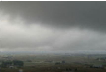
Nimbostratus: Low blankets of cloud, which indicate rain or snow.