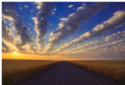
Stratocumulus: A lumpy mass of clouds covering the entire sky, which may produce light rain.