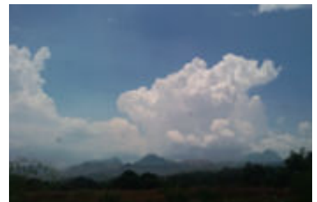
Cumulonimbus: Low clouds with a characteristic flat, anvil-like top. They often bring strong winds, thunder, lightning and even hail.