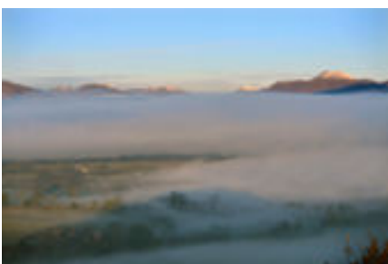
← Stratus: A low, fog-like layer of clouds, which may produce drizzle.