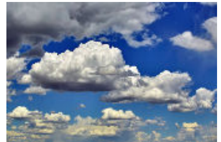
Cumulus: Large, white, fluffy clouds, which indicate fair weather when they are widely separated. If they are large with numerous heads, they can bring intense showers.