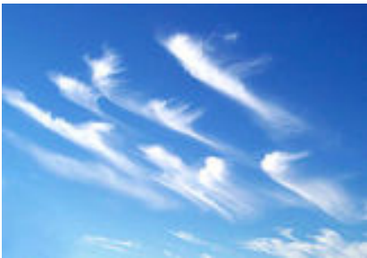
Cirrus: high-altitude, wispy clouds, which indicate fair weather.

Clouds come in many shapes and sizes, and each has its own characteristics! Nature makes an endless supply of different cloud combinations with four basic cloud types: cumulus, stratus, cirrus, and nimbus. What type of clouds do you see? Make a weather prediction today and check later today or tomorrow to see if your prediction was correct. Try painting or drawing the clouds you see! It might be easier using chalk or white crayons on a dark piece of construction paper.