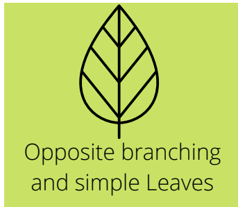
Opposite branching and simple Leaves