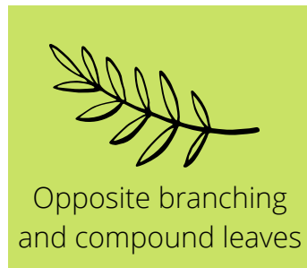
Opposite branching and compound leaves